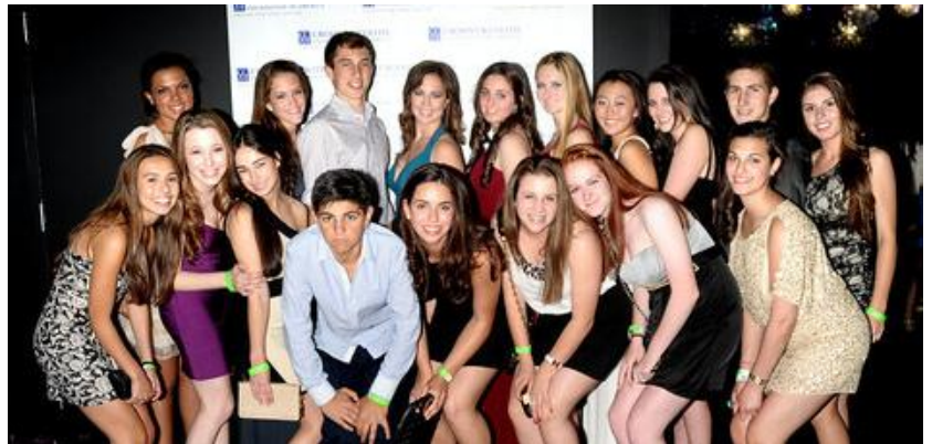
The CCFA Teen Event Committee