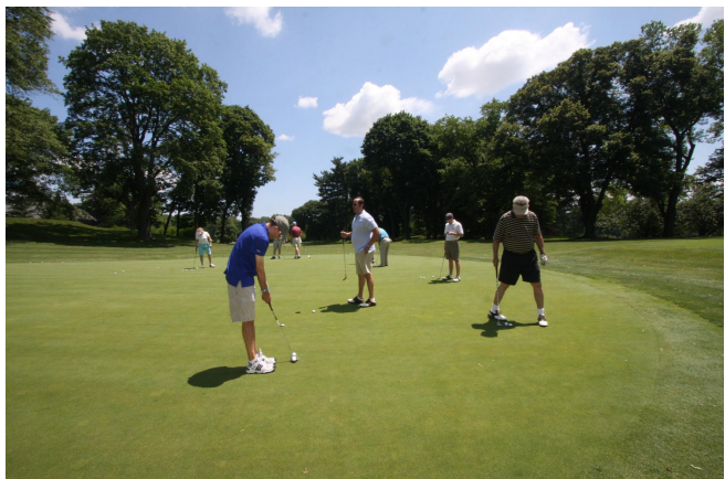
Golfers on the green